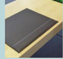
Leather table mats